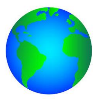
Human-Environment Interactions- People can change their surroundings.